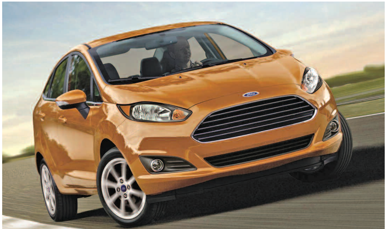
Ford Fiesta is one of the 10 Best Back-to-School Cars of 2016, according to Kelley Blue Book's KBB.com.

Ford Fiesta is one of the 10 Best Back-to-School Cars of 2016, according to Kelley Blue Book's KBB.com. This is the second year in a row Kelley Blue Book has named Fiesta to the list. The uniquely designed Ford Fiesta is one of America's most popular small cars, offering customers a safe, fun, dynamic experience with nimble handling and a comfortable ride - all at an appealing value.