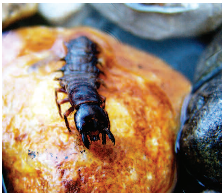
The largest predatory insects found in riffles are known as hellgrammites, which are the larvae of dobsonflies. They'll give you a nasty nip but also make excellent bait for river-dwelling smallmouth bass and trout! (PATRICK BEVIER)

Pacu fish of South America are often released because they grow too big for tanks