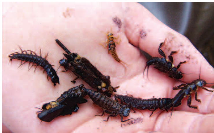
Riffles harbor a wide variety of insect larvae like these stonefly, dragonfly, dobsonfly, and case-building caddis fly nymphs from Perry Creek, a tributary of the Au Sable River.