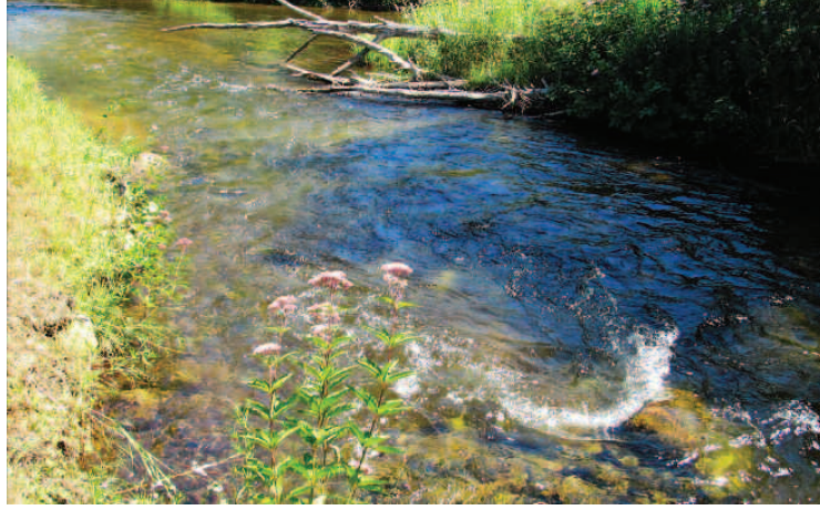
Riffles, like this one on the Sturgeon River in Wolverine, feature shallow water, rocky bottom, fast flows, high oxygen, and diverse life. The Sturgeon is the swiftest river in the Lower Peninsula.