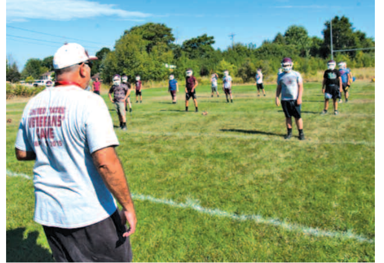
The Charlevoix Rayders Football Head Coach instructs his players in warm up drills on day two of practices. Shoulder pads and helmets go on starting with Wednesday's practice and full pads are on starting with Friday's practice.